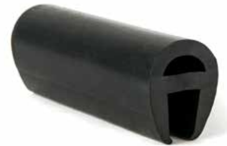
Edge protector, EPDM 60 Duro