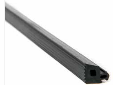
Window press in shim seal, EPDM 60 Duro