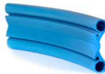
HVAC blade seal, Silicone 60 Duro (two up)