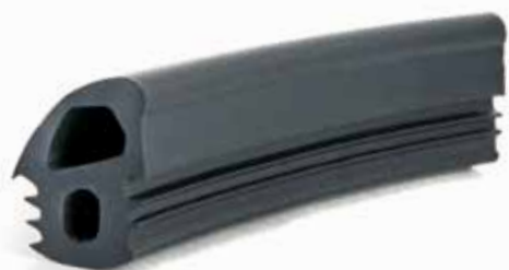
Fridge seal, FDA Silicone 60 Duro