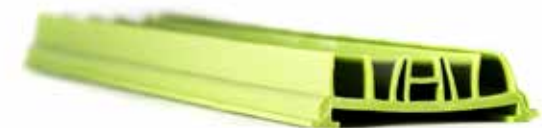
HVAC side seal, Silicone 70 Duro