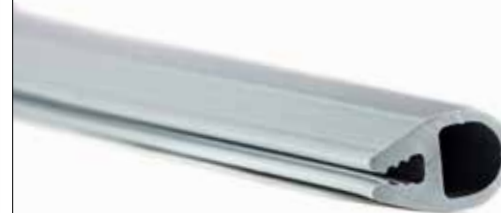
LED lens gasket, Silicone 60 Duro