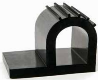
Garbage truck compactor seal, EPDM 70 Duro