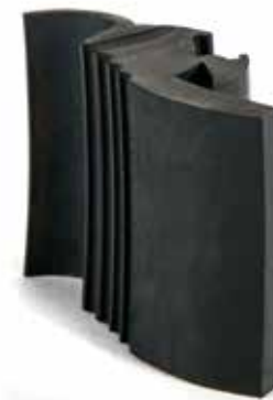
Windshield gasket, EPDM 70 Duro