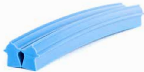
HVAC damper seal, Silicone 60 Duro (two up)