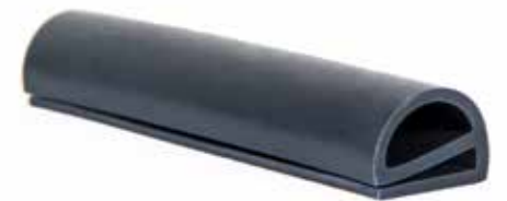
Oven door seal, FDA Silicone 60 Duro