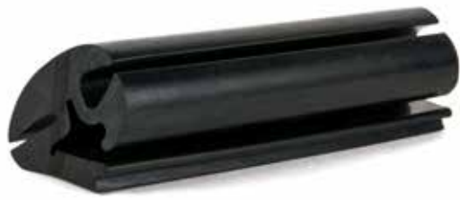
Window glazing channel, EPDM 70 Duro