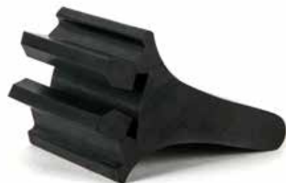
Door seal, Mass Transit EPDM 70 Duro