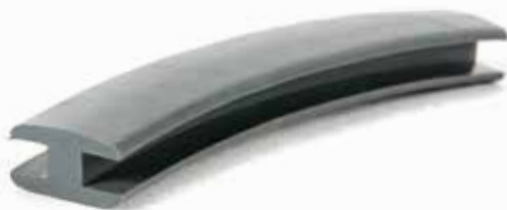
Panel joint seal, Mass transit Silicone 60 Duro