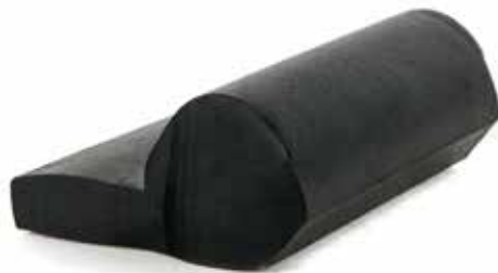
Compactor seal, Neoprene 30 Duro