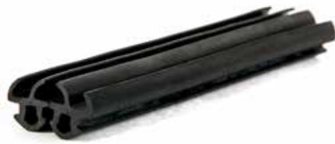
Window sash seal, Silicone 60 Duro (two up)