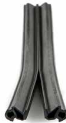
Window seal, EPDM 60 Duro (two up)